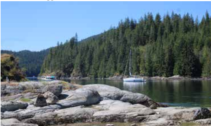
Grace Harbor, Desolation Sound, B.C.