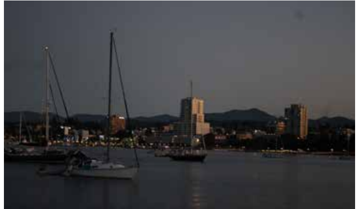
Nanaimo by night