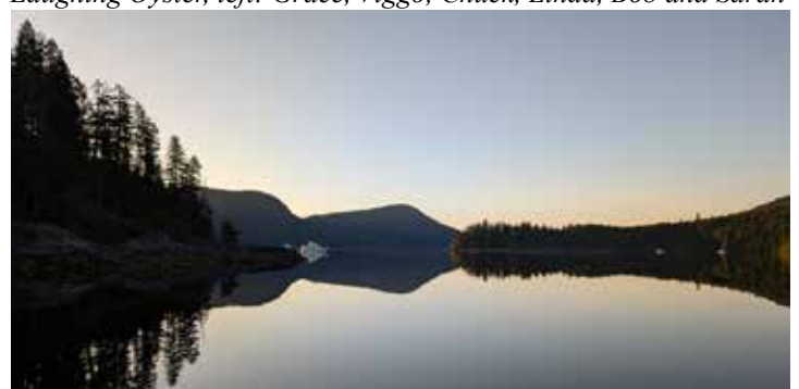
Octopus Island, Quadra Island, B.C.