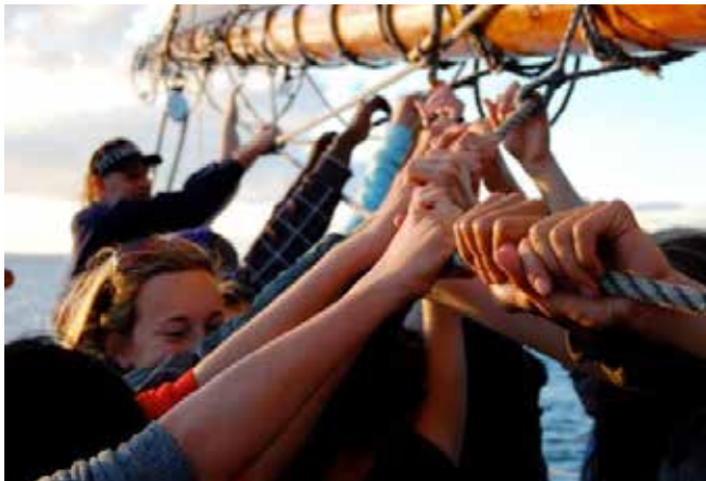
Sat, September 14 2pm-5pm Shilshole Bay Marina

Our mission is youth education, but that doesn't mean you can't have some fun aboard Adventuress, too?