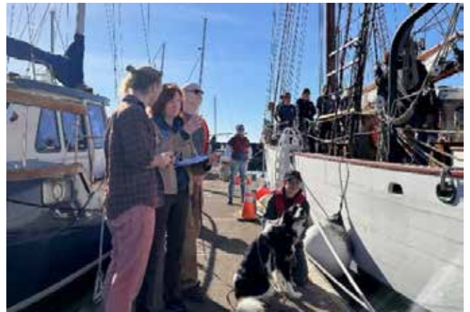
Sun, September 15 2pm-5pm Shilshole Bay Marina