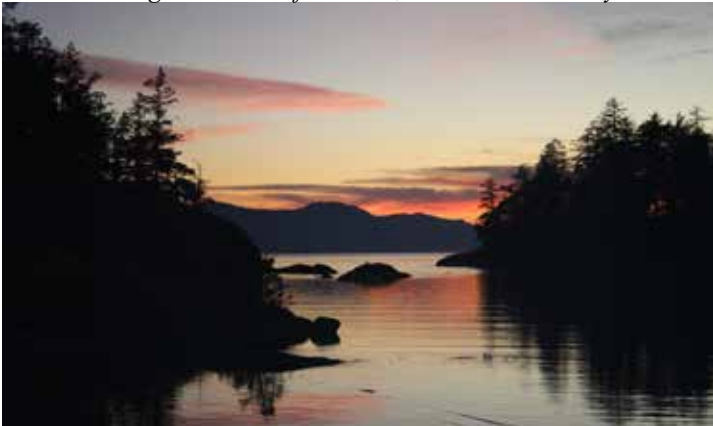
Smuggler Cove, B.C.'s Sunshine Coast, sunset