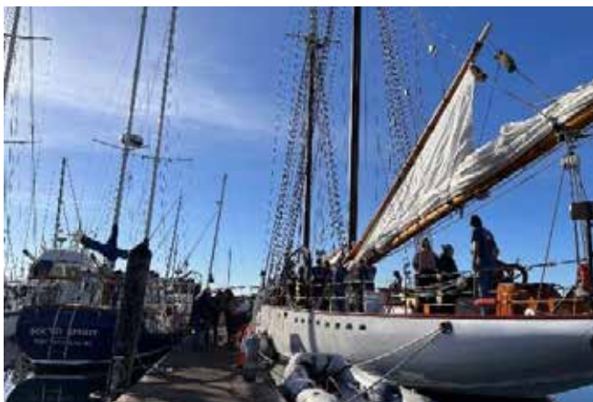
Sat, September 28 2pm-5pm Shilshole Bay Marina