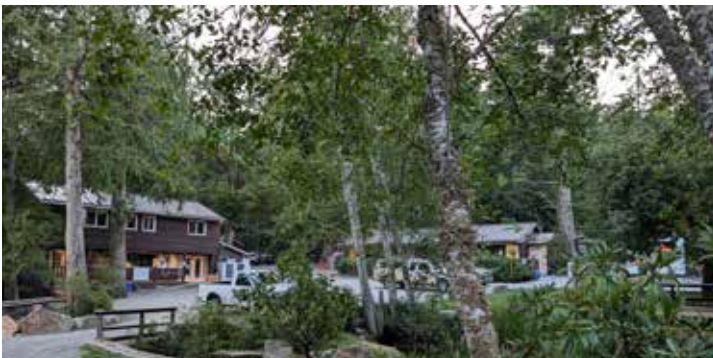
Gorge Harbor, Cortes Island, B.C.