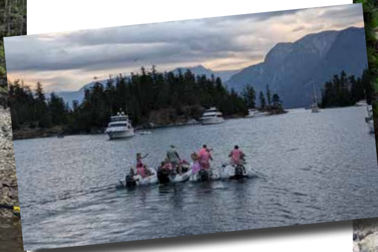
It's party time! We were entertained by some very entertaining Canadians