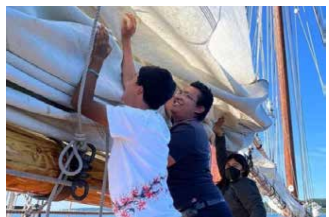
Sun, September 29 3pm-6pm Shilshole Bay Marina