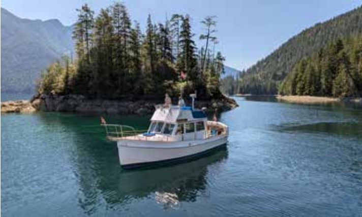
M/V Seascap in Pendrell Sound, B.C.