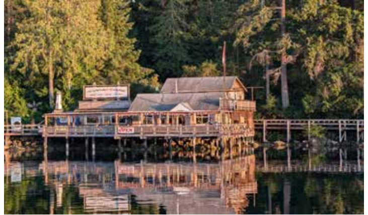
Back to Lund, B.C. to drop off Floisand's and go our own way.