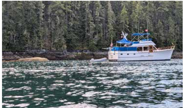
Hetki, anchored out at Prudeaux Haven