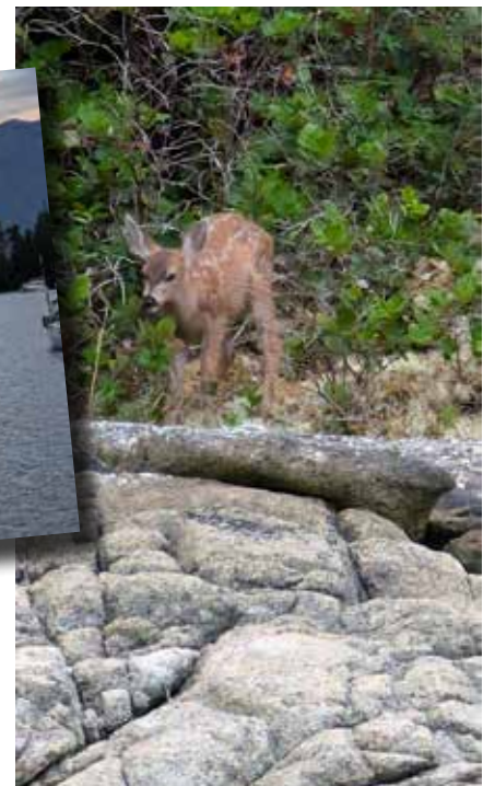
The local wild life