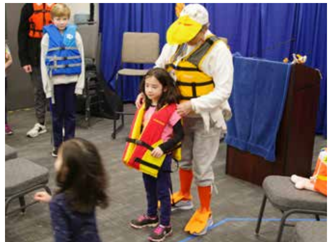
PFD Seagull checking to see if the life jacket fits