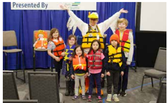
The class of the Seattle Boat Show 2025