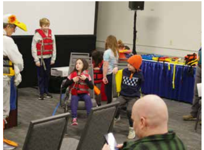
Kids playing the "It's In the Box" game