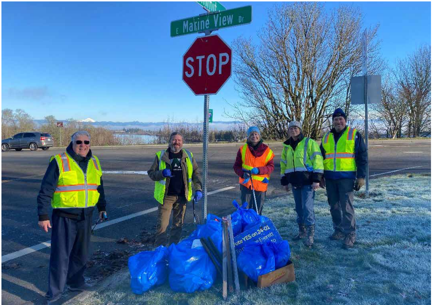
Braving the cold, the Adopt-a-Street clean-up crew