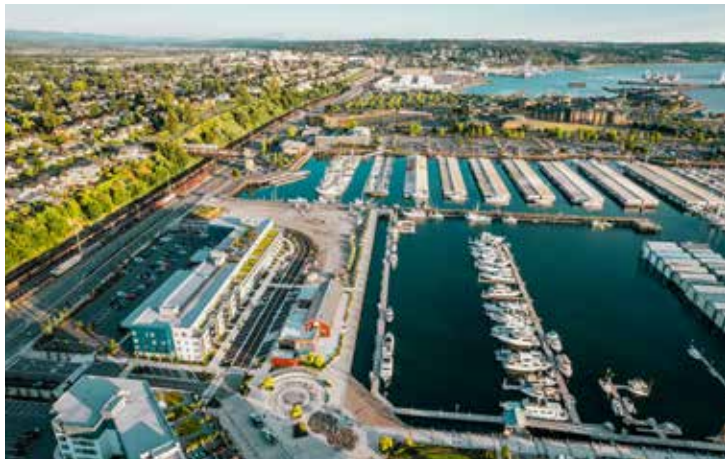
Port of Everett Marina, Everett, Washington